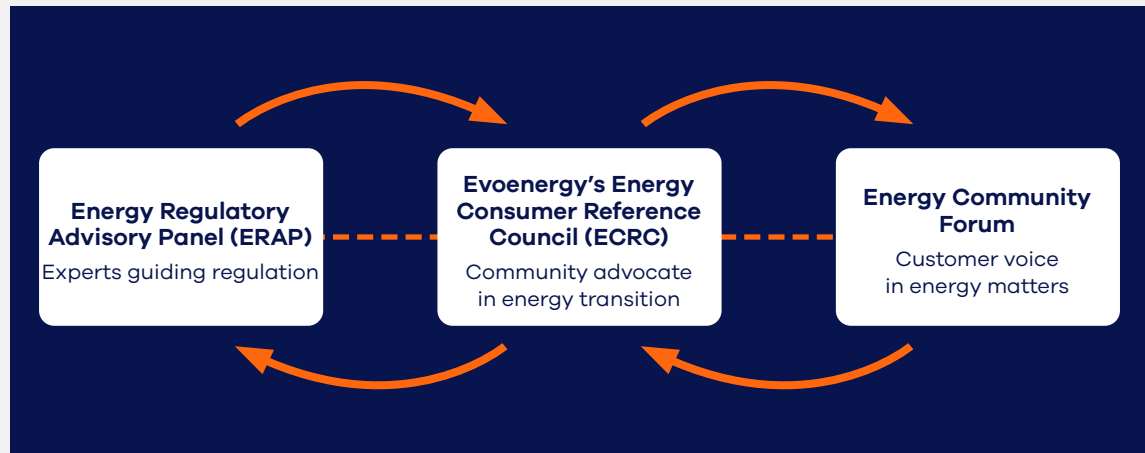
Figure 2: Consumer engagement: evolving our approach

The framework for our engagement approach for GN26 is shown below.